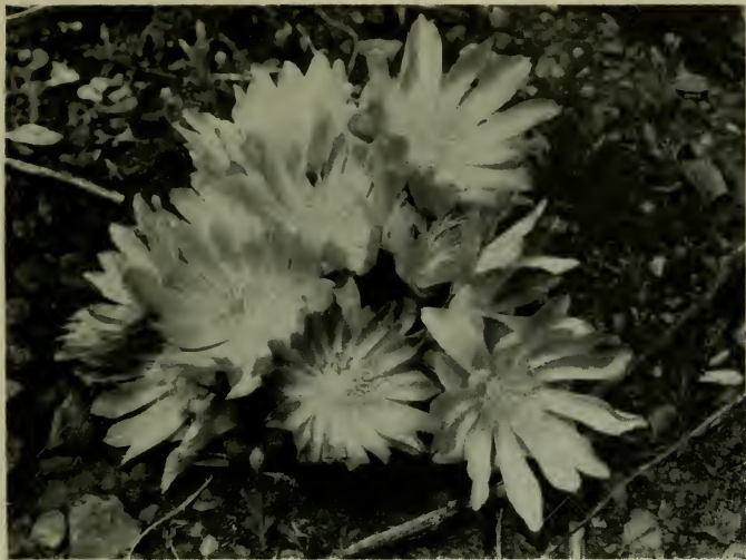
FIGURE 27.—Bitterroot ( Lewisia rediviva Pursh).