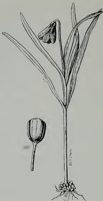
F-243617 FIGURE 8.—Yellow fritillary [ Fritillaria pudica (Pursh) Spreng.], with fruiting capsule.

1. Columbia lily ( Lilium columbianum Hanson), also known as Columbia tiger lily and Oregon lily, is found in moist meadows, open ponderosa pine woods and the like, from Vancouver Island and southern British Columbia south to western Idaho and Humboldt and Sierra Counties, Calif., chiefly in the coastal region. It has a relatively small (1½ to 2 inches broad) ovoid bulb; a slender stem 2 to 4 feet high; leaves in whorls of 5 to 9 or more on the uppermost and lowest leaves scattered; and usually numerous nodding flowers, the reflexed segments reddish orange and purple spotted. Ingram Columbia lily (var. ingramii Hort.) of this species is named after Douglas C. Ingram, a Forest Service officer of the Pacific Northwest Region, who perished in the Camas Creek fire on the old Chelan (now Okanogan) National Forest, Wash., in August 1929. Mr. Ingram, on the side, was an outstanding field naturalist, plant collector, and lily fancier.