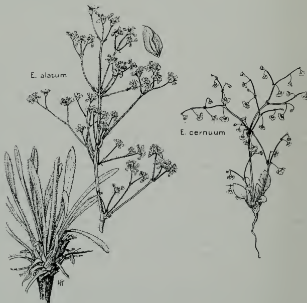
FIGURE 14.—Wing eriogonum ( Eriogonum alatum Torr.) and nodding eriogonum ( E. cernuum Nutt.).

Wing eriogonum ( Eriogonum alatum Torr.) (fig. 14), a rather coarse hairy herb perennial from an elongated thick taproot, ranges from the Panhandle area of Texas, through western Okla-