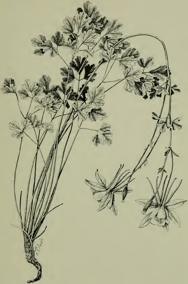
FIGURE 36.—Colorado columbine ( Aquilegia caerulea James).