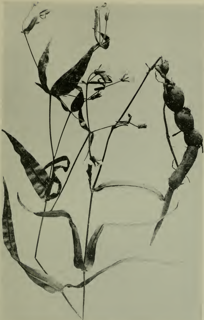
FIGURE 31.—Tuber starwort ( Stellaria jamesiana Torr.).