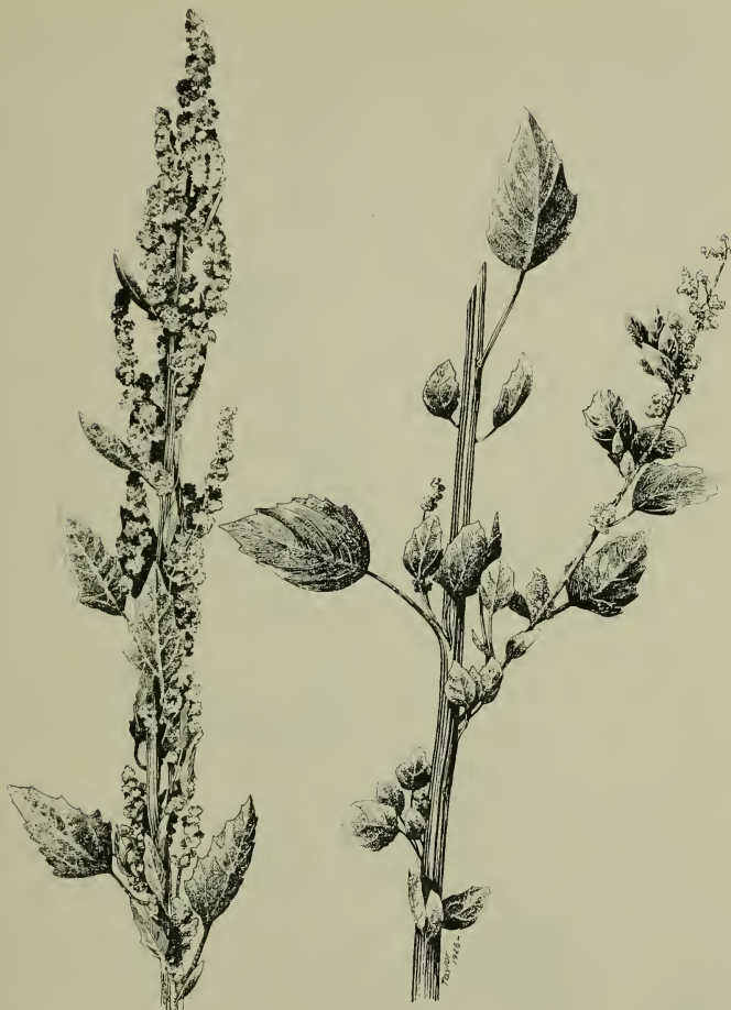
FIGURE 20.—Lambsquarters goosefoot ( Chenopodium album L.). F-478352

and Colorado. It has been attributed also to eastern Oregon, California, and New Mexico but this has occasioned controversy. The plant is an erect annual, 20 inches high or less, simple or branched; the small (under 1.2 inches) oblong to ovate leaves are rounded to wedgelike at base; the flowers in short dense spikes. It is of little value for sheep.