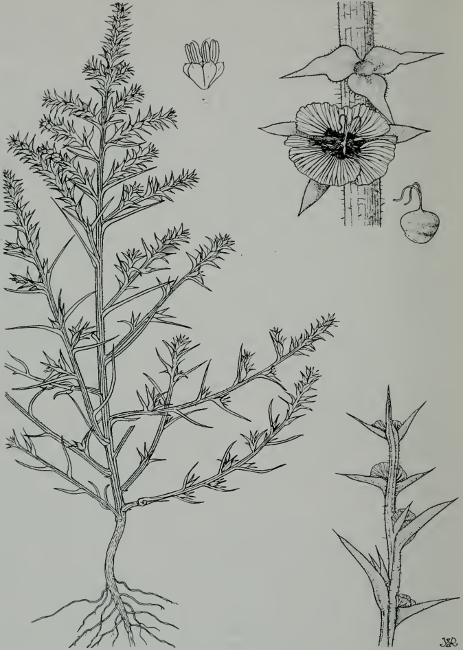
FIGURE 23.—Russian-thistle ( Salsola kali var. tenuifolia Tausch, syn. S. pestifer A. Nels.). Individual flower (at top), fruiting calyx and utricle with persistent styles (upper right).