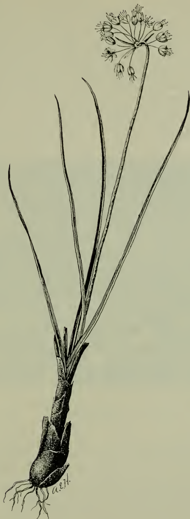
F-287103 FIGURE 3.—Nodding onion ( Allium cernuum Roth).