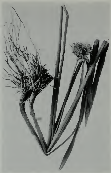
FIGURE 2.—Pacific onion ( Allium validum S. Wats.).