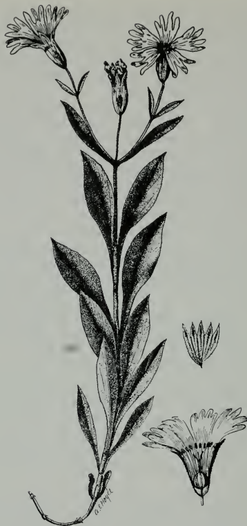
F-481214 FIGURE 30.—Ingram silene ( Silene in- gramii Tidestr. & Dayt.).

ney and Peebles (109) call it "Arizona's showiest species of Silene ."