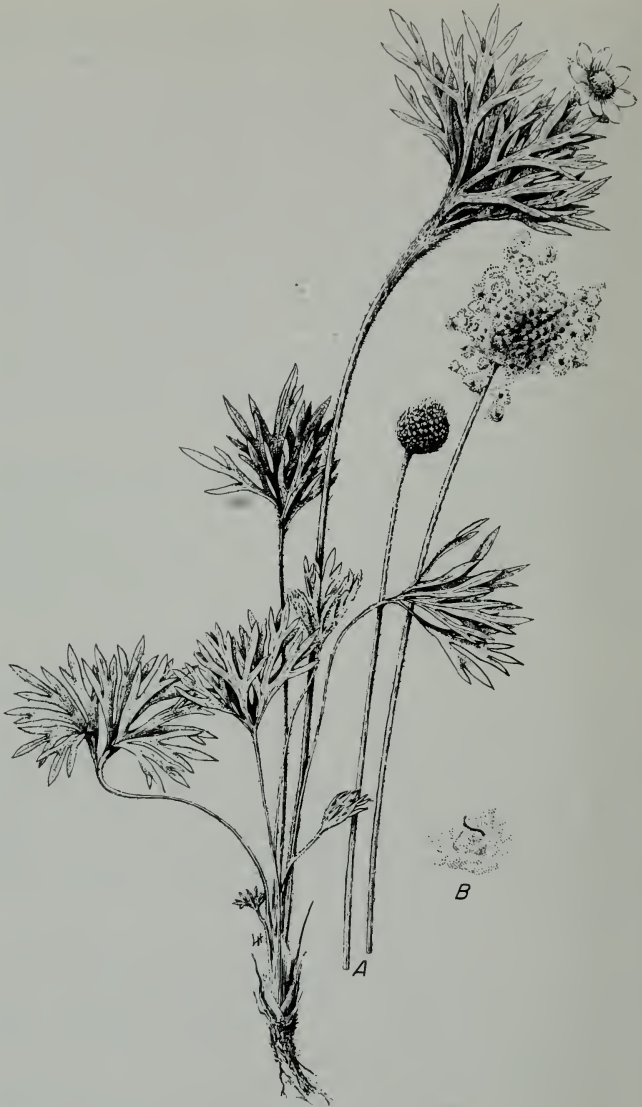
FIGURE 32.—Globe anemone ( Anemone globosa Nutt.): A, Fruiting heads; B, individual fruit ( achene ). F-287106