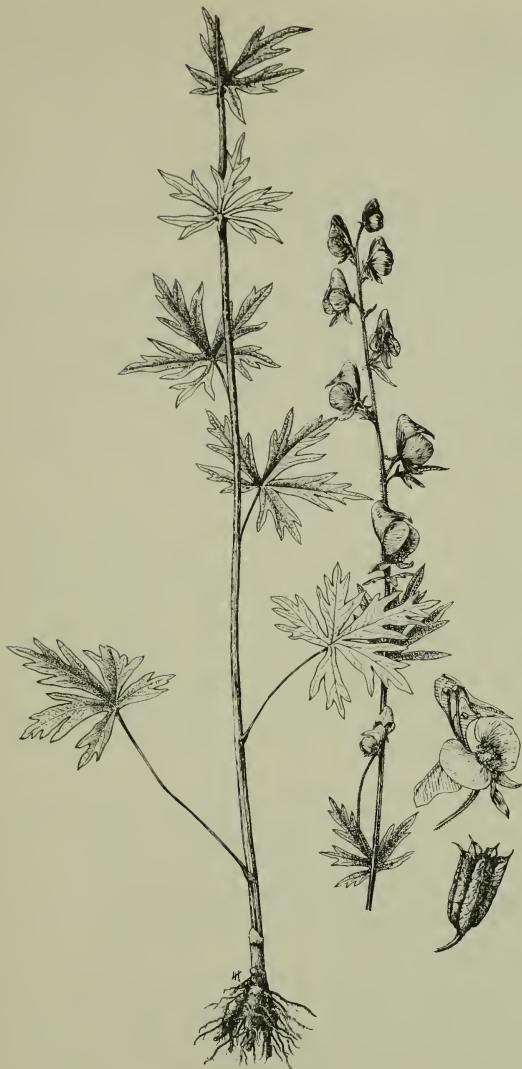
FIGURE 34.—Columbia monkshood ( Aconitum columbianum Nutt., syns. A. arizonicum Greene, A. patens Rydb.). Individual flower and cluster of fruiting follicles in lower right.