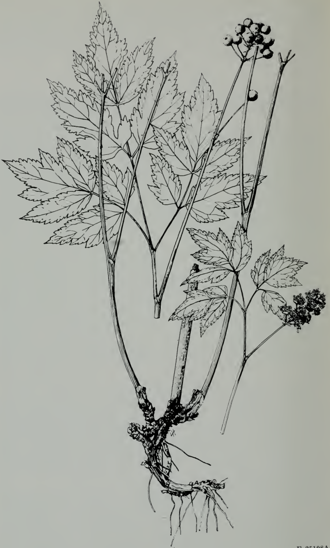
FIGURE 35.—Western baneberry [ Actea arguta Nutt., syn. A. spicata var. arguta (Nutt.) Torr.].