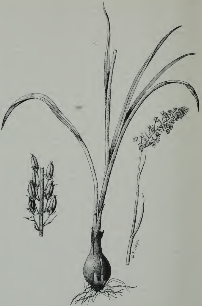
FIGURE 11.—Foothill deathcamas [ Zigadenus paniculatus (Nutt.) S. Wats.]. Flowering panicle at right; part of fruiting stalk at left.