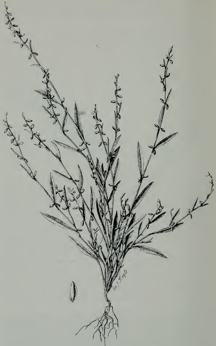
FIGURE 18.—Douglas knotweed ( Polygonum douglasii Greene). F-248225